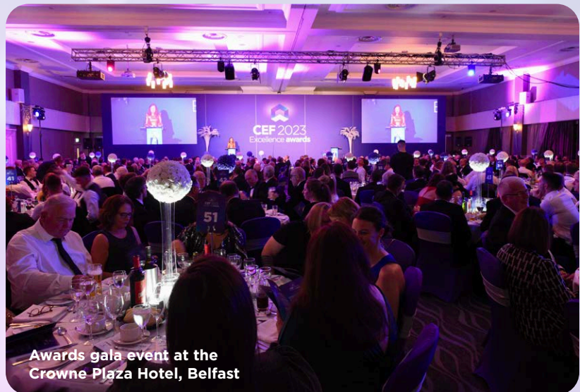
Awards gala event at the Crowne Plaza Hotel, Belfast

The 2023 Awards were the most successful yet with 26 categories recognised and the gala dinner was attended by 600 people from the construction and wider business community including industry leaders from GB and Ireland.