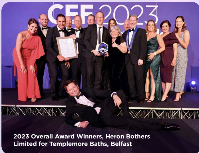
2023 Overall Award Winners, Heron Bothers Limited for Templemore Baths, Belfast

The 2024 event will combine a prestige dinner for over 600 guests, with keynote speakers and quality entertainment with a significant on-line social media presence supported by our media partners at NI Builder Magazine. In that way we can ensure maximum exposure for our finalists and sponsors before, during and after the event. Social media impressions within a month of the 2023 event totalled over 1 million.